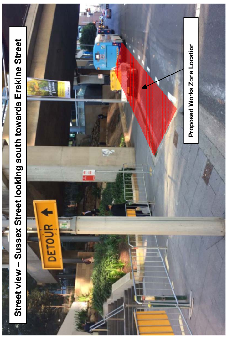
Street view – Sussex Street looking south towards Erskine Street